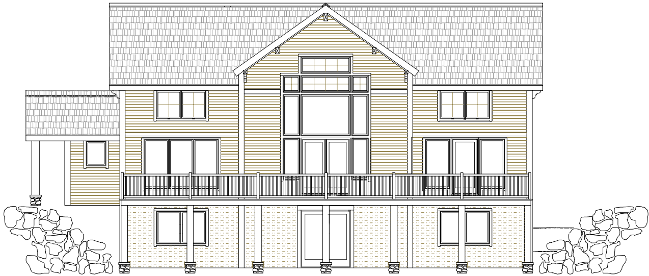
Great Room Side Elevation