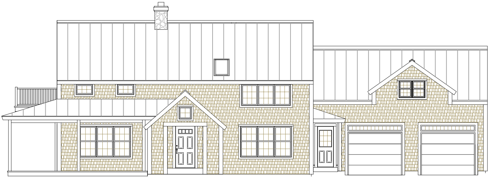
Entry Side Elevation