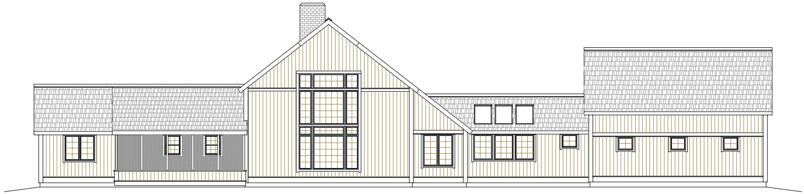
Great Room End Elevation