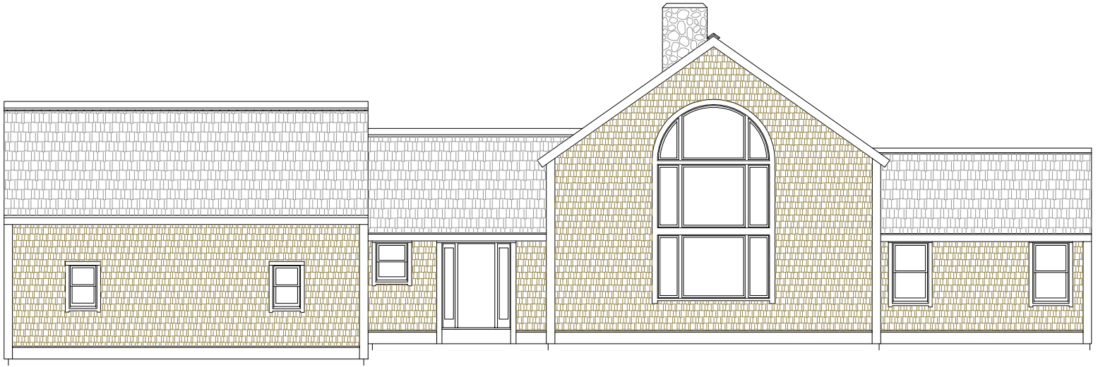
Great Room Side Elevation