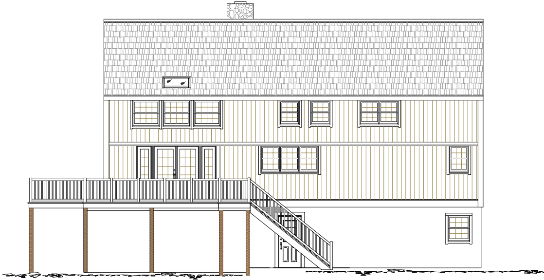
Kitchen Side Elevation