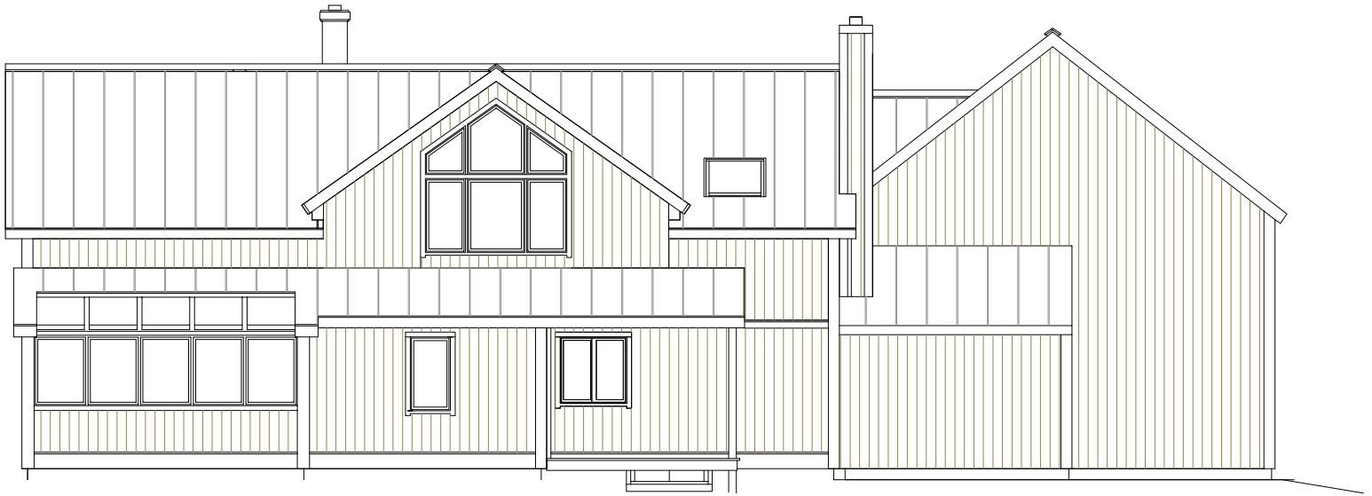
Entry Side Elevation