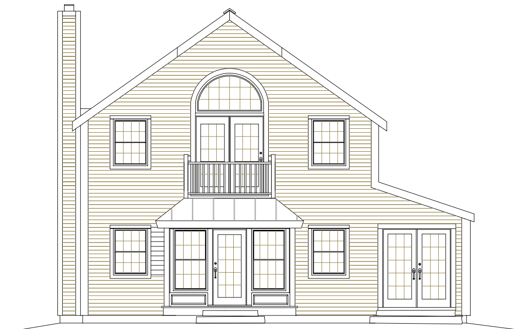
Entry End Elevation