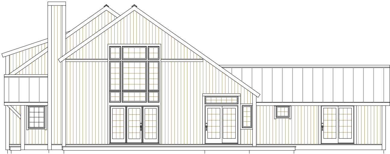
Great Room End Elevation