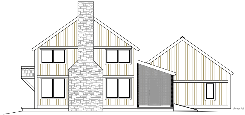
Living Room End Elevation