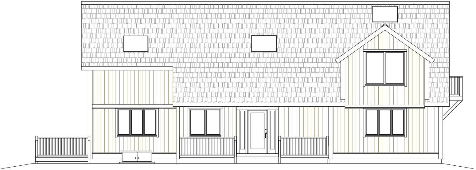
Entry Side Elevation